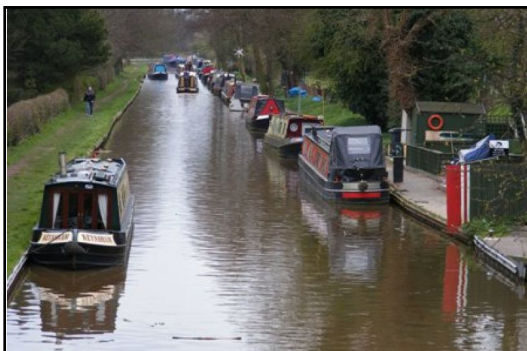
View along the site from Bridge 48

The Mooring Agreement starts on 04/07/2008.